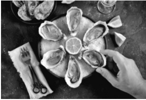
oyster-shells on a plate

by Sarah Waters, British writer (b.1966)